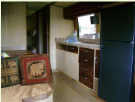
Front living space.