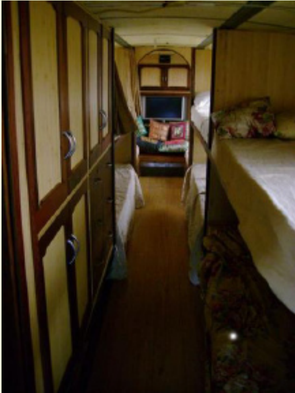
Hallway to sleepers and cabinetry (left) for personal storage.