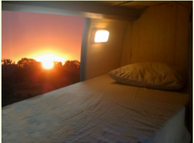
Sleeper bunk with organic foam pads.