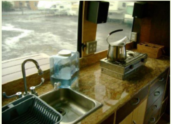
Kitchenette with marble countertop.